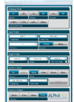
A dedicated GUI allows to control all synchronization parameters